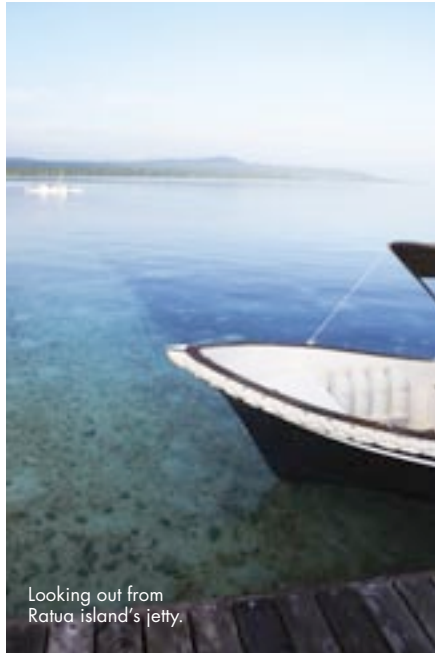
Looking out from Ratua island's jetty.

The philosophy of Ratua is luxurious (and exclusive) escapism, but with minimal disturbance to Vanuatu's largely unspoiled essence. And so pleasures here are of the simple kind: waking at dawn to spot giant turtles playing in the waves; deep sleeps on day beds overlooking your personal private beach; an afternoon horse ride through the coconut palms to the wild western shore; long, lazy dinners at the Yacht Club — Ratua's ambient social hub, where antique lanterns and a bonfire light up the beach and the staff serves freshly caught seafood and produce grown in the island's kitchen garden.