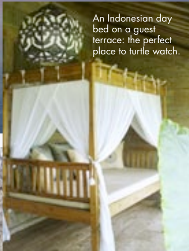
An Indonesian day bed on a guest terrace: the perfect place to turtle watch.