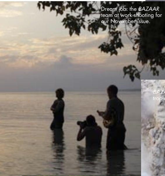
Dream job: the BAZAAR team at work shooting for our November issue.