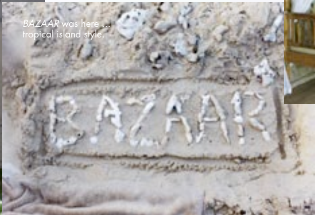
BAZAAR was here ... tropical island style.