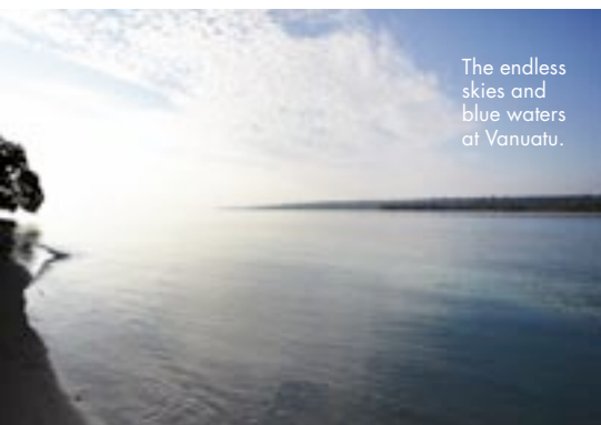
The endless skies and blue waters at Vanuatu.

Ratua Private Island, via Espiritu Santo, Vanuatu, +61 (0) 2 9280 2205; www.ratua.com.au . Air Vanuatu flies to Espiritu Santo, Vanuatu, directly from Sydney and Brisbane, with additional connecting flights from arrivals into Port Vila, www.airvanuatu.com